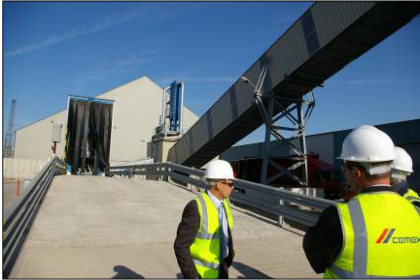
The UK's first vertical mill 2009